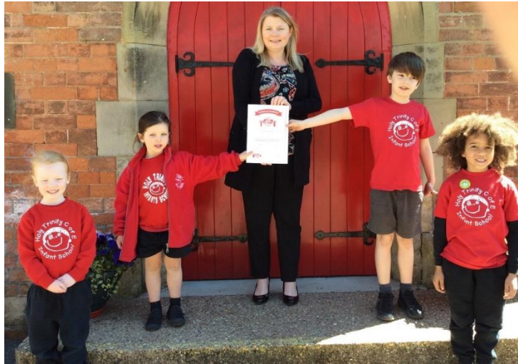
Holy Trinity CE Infant School, Southwell Bronze Global Neighbours award holders

the world, which can be transformative for all involved as we ‘tap into’ God’s reality and his vision for the future of his world where justice and mercy will reign.