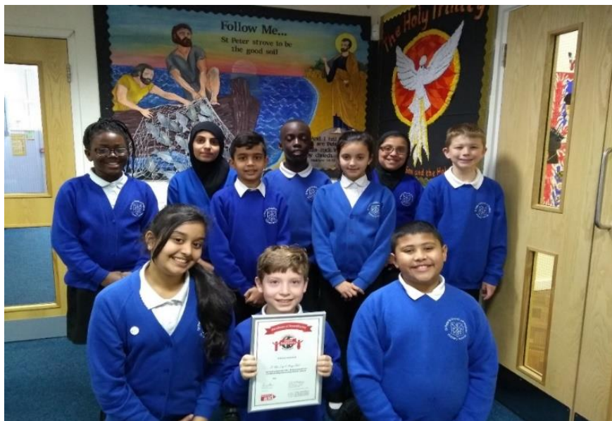
St Peter’s CE Primary School, Rochdale receiving their Global Neighbours Bronze award

‘What does the Lord require of you? To act justly and to love mercy and to walk humbly with your God’ (Micah 6:8)