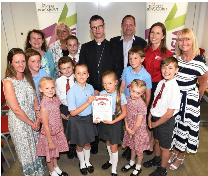
The first two schools in the country to achieve Global Neighbours Bronze Awards: Wilson’s Endowed CE Primary School and Whittle-le-Woods CE Primary School

As educators we must consider how to channel this righteous ‘table turning’ anger in constructive ways that harness the energy of youth but never patronise or put limits on their passion.