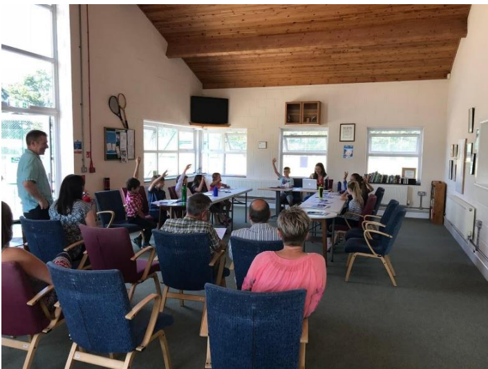
St Luke's CE Primary School, Sway Global Neighbours Gold award holders: Sway Parish Junior Council meeting.

From St Luke's CE Primary School, Sway , Global Neighbours Gold Assessment