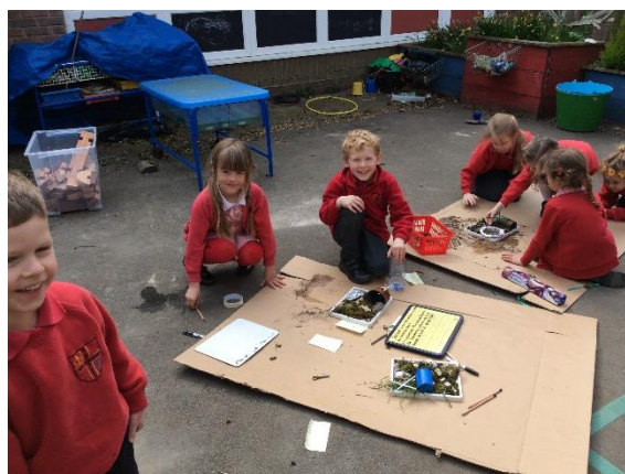
Reception & Year 1 exploring the question 'Why do Christians put a cross in an Easter garden?'